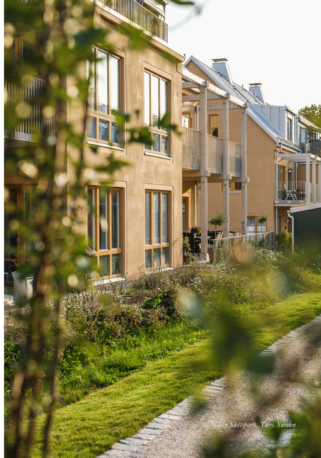
Näsby Slottspark, Täby, Sweden

Niam shall strive to always meet our stakeholder's expectations on transparency by providing factual, reliable, and relevant information.