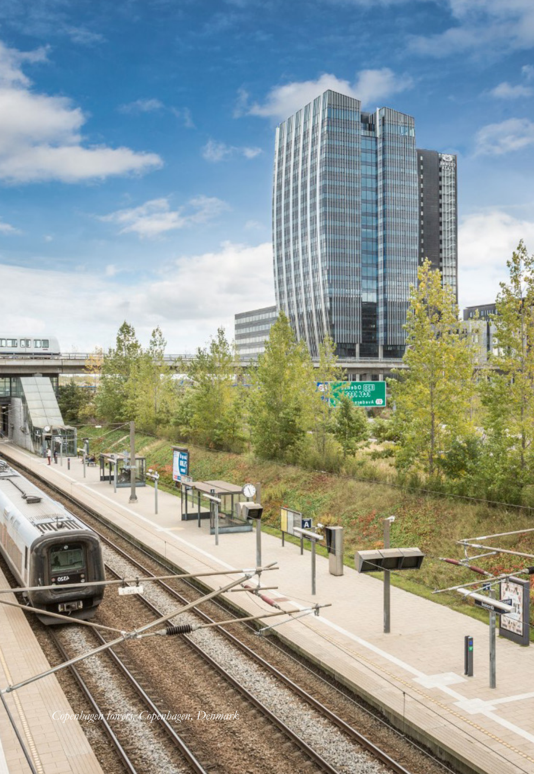
Copenhagen towers, Copenhagen, Denmark