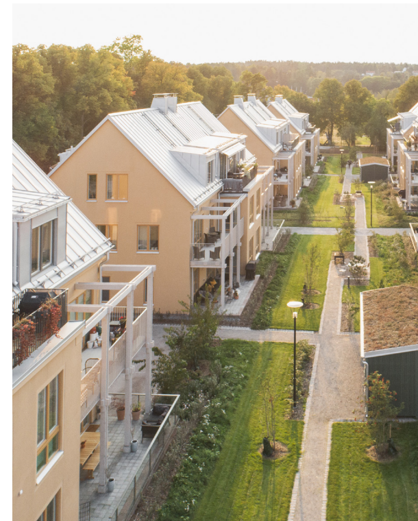
Näsby Slottspark, Täby, Sweden