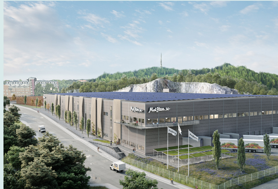
Mathem, Last Mile Logistic, Larsboda, Sweden